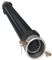
cam & groove x cam & groove