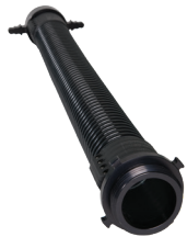
female L/H x male R/L