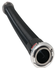
storz x storz