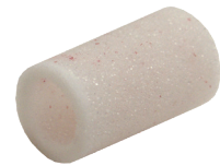
5 micron element 5925-03