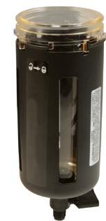
transparent bowl and guard 4325-51R